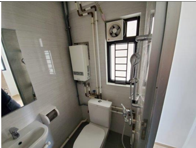
(toilet of a self-content room )