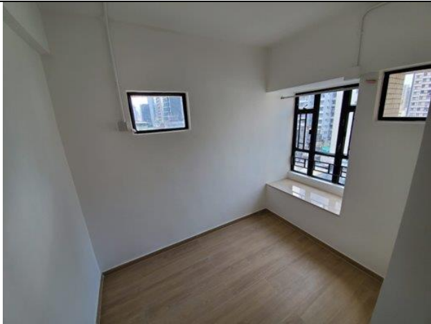
(one of the self-contained rooms)