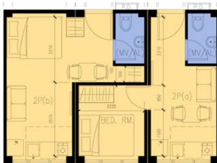
2 - person unit