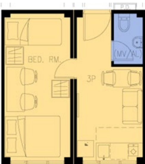
3 - person unit