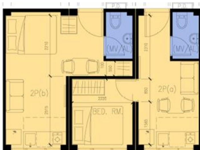
2 - person unit