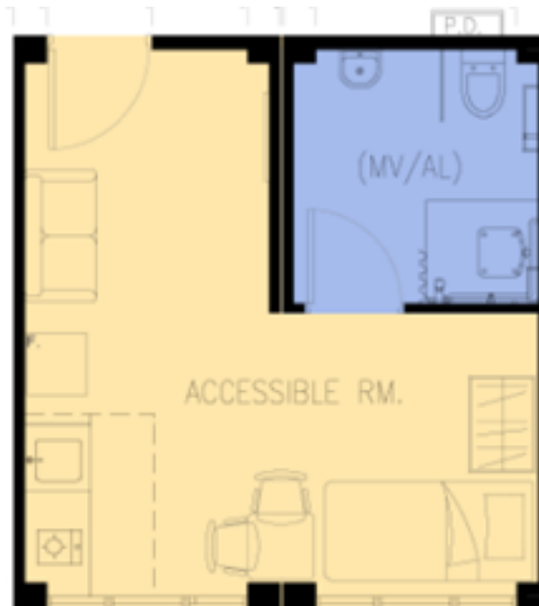
Accessible unit (Furniture is not included) (Not available for this application)