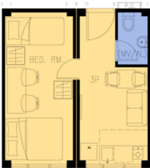
3 - person unit (Furniture is not included)